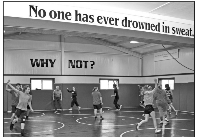
Towns County wrestling prepares to open the season with a duals tournament in Hayesville, NC on Nov. 30.

"Right now, we are more of a building team as we look to prepare to accommodate more weight classes versus the past