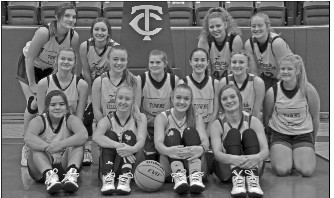
The Towns County men and women's basketball teams sit at 1-1 after the first week of the regular season. Both squads look to move above.500 entering Thanksgiving with a Tuesday night home win over Hiwassee Dam, NC.